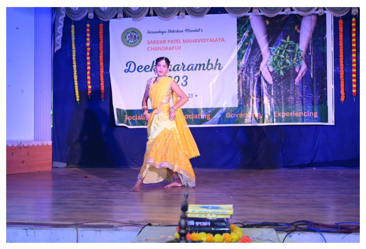
Cultural program presentation by senior and fresher students