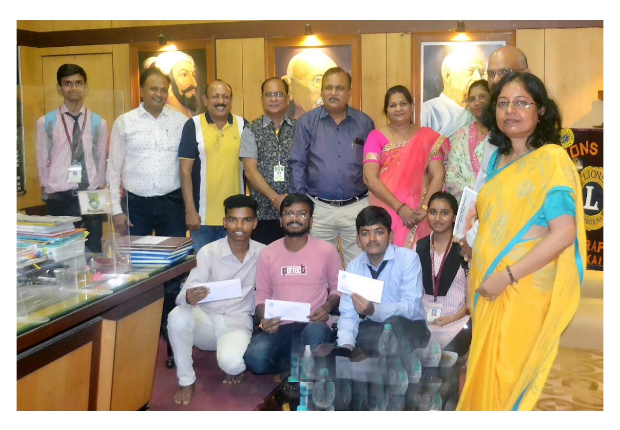
Winners of Ecofriendly Ganesha Competition 2023 with Alumni