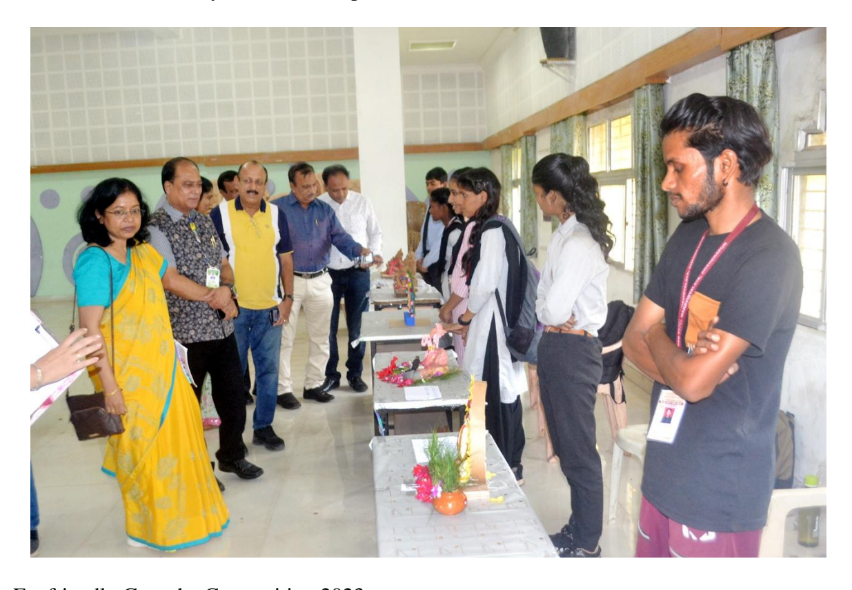
Ecofriendly Ganesha Competition 2023